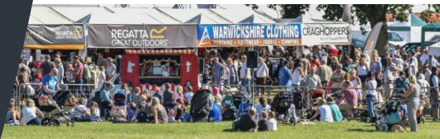
Living Heritage 2019/21,22,23,24,25