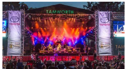
Tamworth Summer & Winter Events 2023