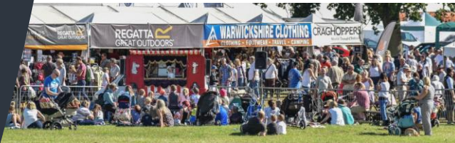
Living Heritage 2019/2021/2022/2023