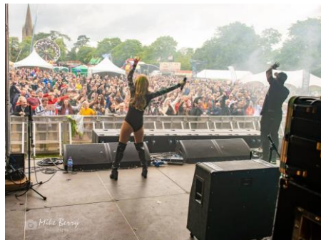
Witney Music Festival 2022/2023